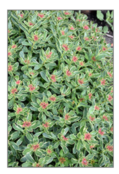
Variegated Russian Stonecrop foliage