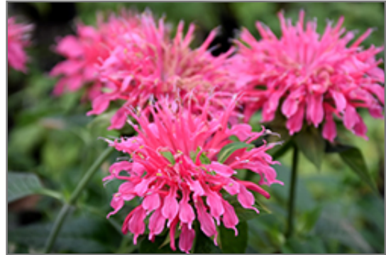
Coral Reef Beebalm flowers

Coral Reef Beebalm is recommended for the following landscape applications;