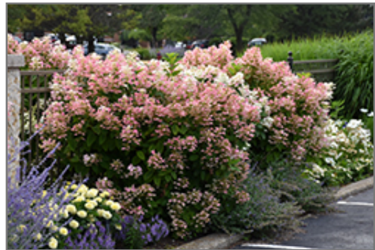
Quick Fire Hydrangea in bloom