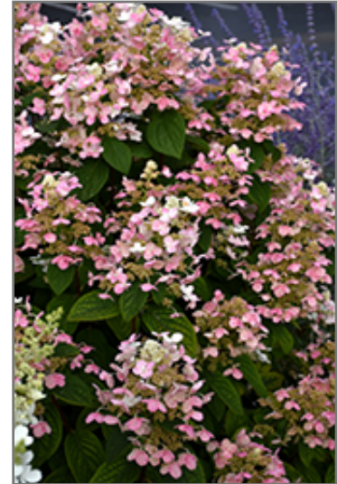
Quick Fire Hydrangea flowers