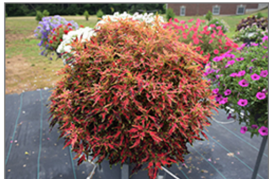
ColorBlaze Mini Me Watermelon Coleus