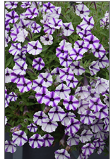
Supertunia Mini Vista Violet Star Petunia flowers

Supertunia Mini Vista Violet Star Petunia is a dense herbaceous annual with a trailing habit of growth, eventually spilling over the edges of hanging baskets and containers. Its medium texture blends into the garden, but can always be balanced by a couple of finer or coarser plants for an effective composition.