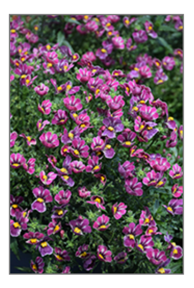
Nesia Tutti Frutti Nemesia flowers

Nesia Tutti Frutti Nemesia is recommended for the following landscape applications;