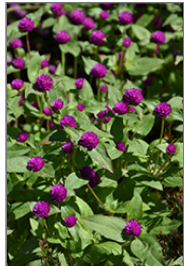
Pinball Purple Globe Amaranth flowers