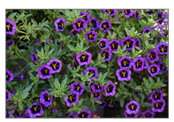
Cabaret Midnight Kiss Calibrachoa flowers