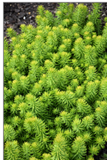
Prima Angelina Stonecrop

Prima Angelina Stonecrop is recommended for the following landscape applications;