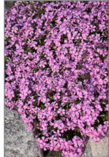
Eye Candy Creeping Phlox in bloom

Eye Candy Creeping Phlox is recommended for the following landscape applications;