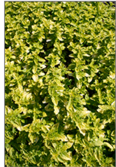
Drops of Jupiter Oregano foliage

Drops of Jupiter Oregano is a fine choice for the garden, but it is also a good selection for planting in outdoor pots and containers. It can be used either as 'filler' or as a 'thriller' in the 'spiller-thriller-filler' container combination, depending on the height and form of the other plants used in the container planting. It is even sizeable enough that it can be grown alone in a suitable container. Note that when growing plants in outdoor containers and baskets, they may require more frequent waterings than they would in the yard or garden.