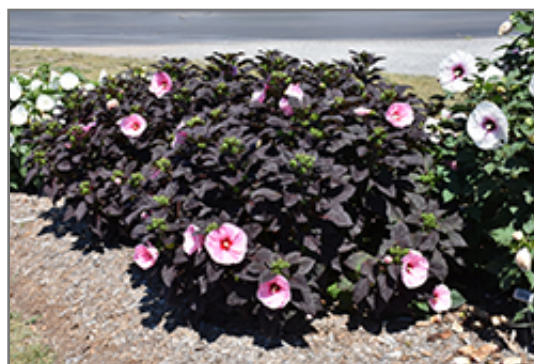
Summerific Edge of Night Hibiscus in bloom