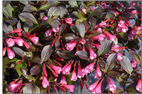
Very Fine Wine Weigela flowers