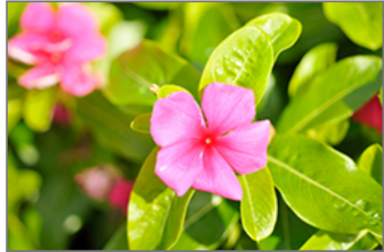
Pacifica XP Punch Vinca flowers

This plant will require occasional maintenance and upkeep, and should not require much pruning, except when necessary, such as to remove dieback. It is a good choice for attracting butterflies to your yard, but is not particularly attractive to deer who tend to leave it alone in favor of tastier treats. It has no significant negative characteristics.