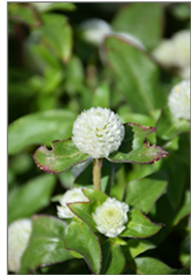
Gnome White Gomphrena flowers

Gnome White Gomphrena is recommended for the following landscape applications;