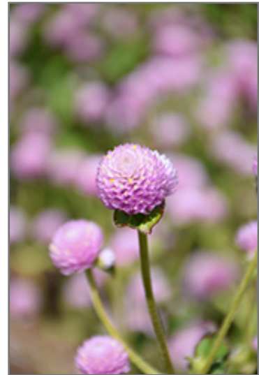
Gnome Pink Gomphrena flowers

Gnome Pink Gomphrena is recommended for the following landscape applications;