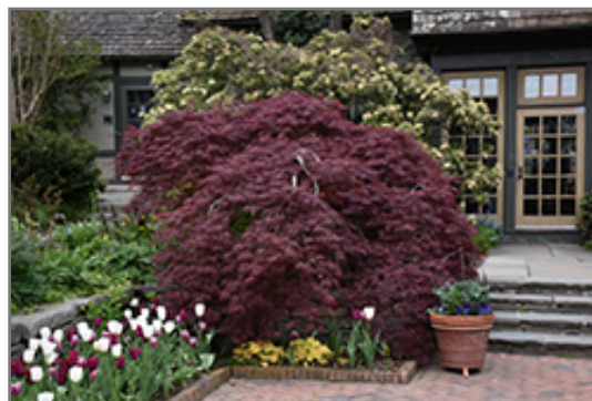
Tamukeyama Japanese Maple

Tamukeyama Japanese Maple is recommended for the following landscape applications;