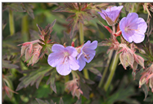
Boom Chokolatta Cranesbill flowers

This is a relatively low maintenance plant, and should only be pruned after flowering to avoid removing any of the current season's flowers. Deer don't particularly care for this plant and will usually leave it alone in favor of tastier treats. It has no significant negative characteristics.