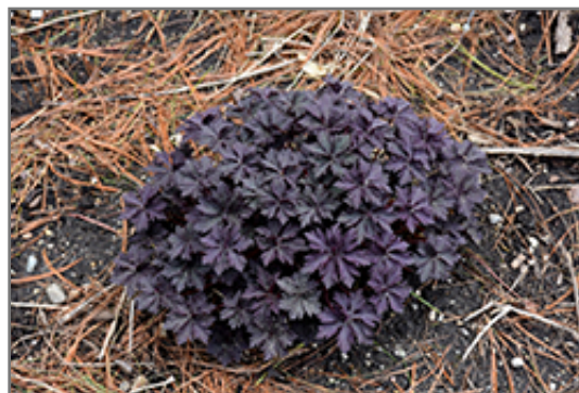
Boom Chocolatta Cranesbill

Boom Chocolatta Cranesbill will grow to be about 24 inches tall at maturity, with a spread of 30 inches. When grown in masses or used as a bedding plant, individual plants should be spaced approximately 28 inches apart. Its foliage tends to remain dense right to the ground, not requiring facer plants in front. It grows at a medium rate, and under ideal conditions can be expected to live for approximately 10 years. As an herbaceous perennial, this plant will usually die back to the crown each winter, and will regrow from the base each spring. Be careful not to disturb the crown in late winter when it may not be readily seen!