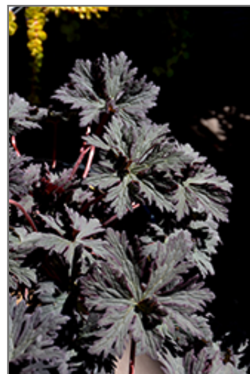
Boom Chokolatta Cranesbill foliage