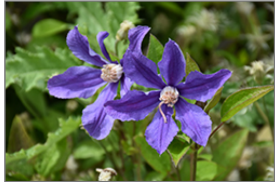
Rain Dance Clematis flowers

Rain Dance Clematis is recommended for the following landscape applications;