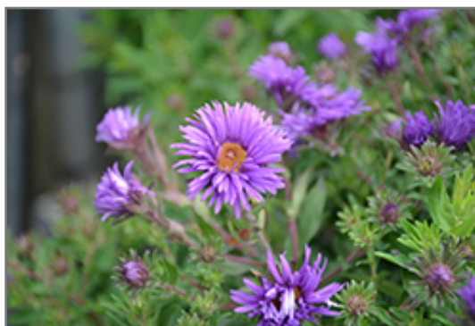
Grape Crush New England Aster flowers