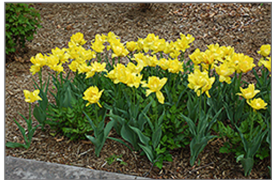
Monte Carlo Tulip in bloom