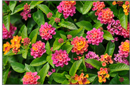
Bloomify Rose Lantana flowers

Bloomify Rose Lantana is recommended for the following landscape applications;