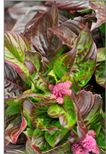
Sol Gekko Green Celosia flowers

Sol Gekko Green Celosia is recommended for the following landscape applications;