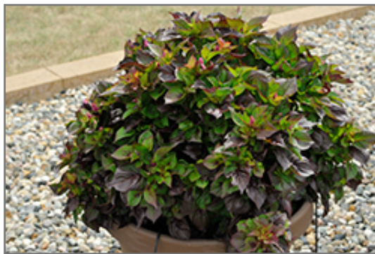
Sol Gekko Green Celosia