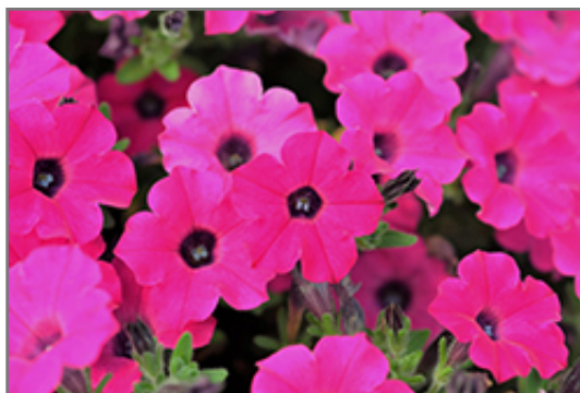
Itsy Magenta Petunia flowers