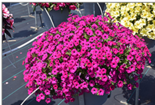
Itsy Magenta Petunia in bloom