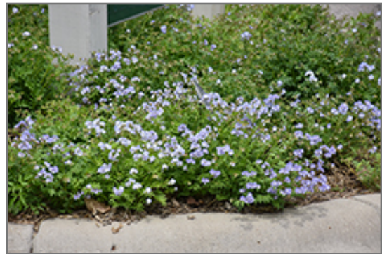
Creeping Jacob's Ladder in bloom