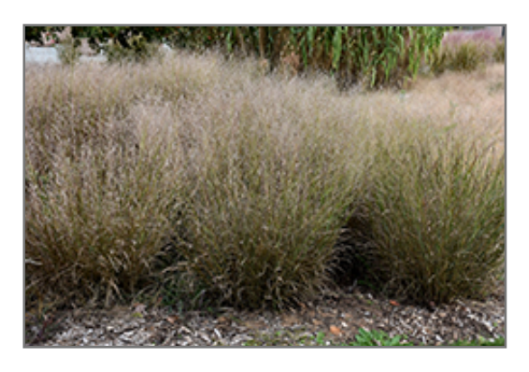
Shenandoah Reed Switch Grass fruit