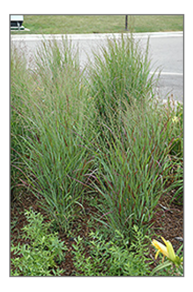
Shenandoah Reed Switch Grass