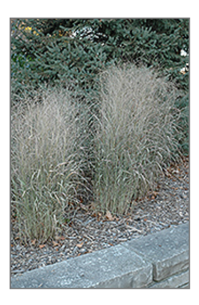
Shenandoah Reed Switch Grass in fall

This plant does best in full sun to partial shade. It is very adaptable to both dry and moist locations, and should do just fine under typical garden conditions. It is considered to be drought-tolerant, and thus makes an ideal choice for a low-water garden or xeriscape application. It is not particular as to soil type, but has a definite preference for alkaline soils, and is able to handle environmental salt. It is somewhat tolerant of urban pollution. This is a selection of a native North American species. It can be propagated by division; however, as a cultivated variety, be aware that it may be subject to certain restrictions or prohibitions on propagation.