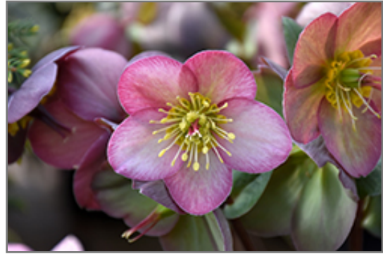
FrostKiss Cheryl's Shine Hellebore flowers

This is a relatively low maintenance plant, and should be cut back in late fall in preparation for winter. Deer don't particularly care for this plant and will usually leave it alone in favor of tastier treats. It has no significant negative characteristics.