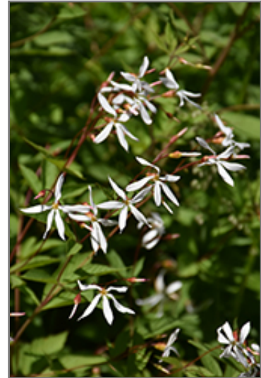
Bowman's Root flowers

This plant will require occasional maintenance and upkeep, and should be cut back in late fall in preparation for winter. It is a good choice for attracting bees and butterflies to your yard. It has no significant negative characteristics.