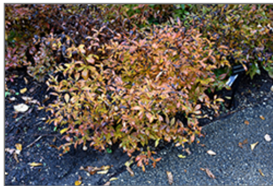
Bowman's Root in fall