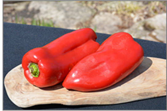
Gypsy Sweet Pepper fruit