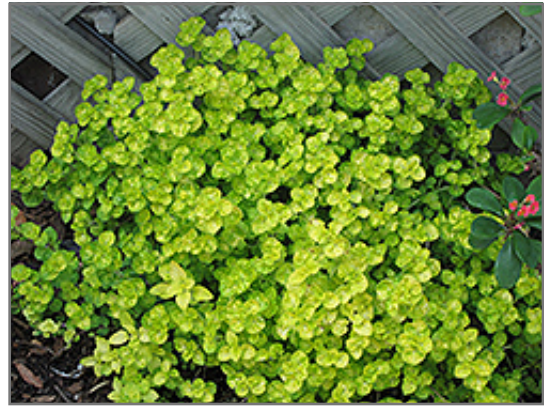
Golden Oregano

Aside from its primary use as an edible, Golden Oregano is suitable for the following landscape applications;