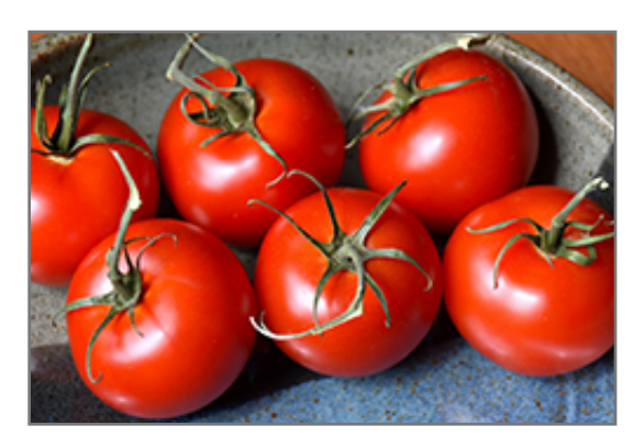
Patio Tomato fruit