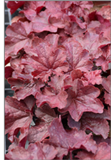
Northern Exposure Red Coral Bells foliage

Northern Exposure Red Coral Bells is recommended for the following landscape applications;