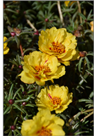
Happy Hour Banana Portulaca flowers

Happy Hour Banana Portulaca is recommended for the following landscape applications;