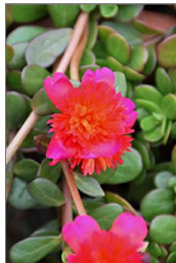
ColorBlast Double Magenta Portulaca flowers

ColorBlast Double Magenta Portulaca is recommended for the following landscape applications;