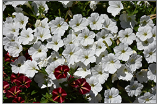
ColorRush White Petunia flowers

ColorRush White Petunia is recommended for the following landscape applications;