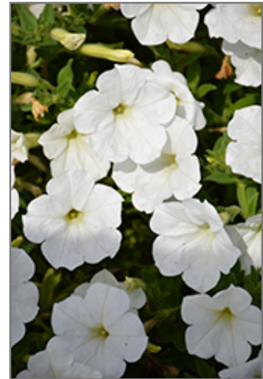
ColorRush White Petunia flowers