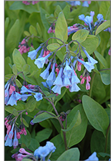
Virginia Bluebells flowers