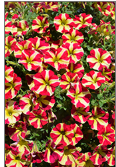
Amore Queen of Hearts Petunia flowers

This plant will require occasional maintenance and upkeep. Trim off the flower heads after they fade and die to encourage more blooms late into the season. It is a good choice for attracting butterflies and hummingbirds to your yard, but is not particularly attractive to deer who tend to leave it alone in favor of tastier treats. It has no significant negative characteristics.