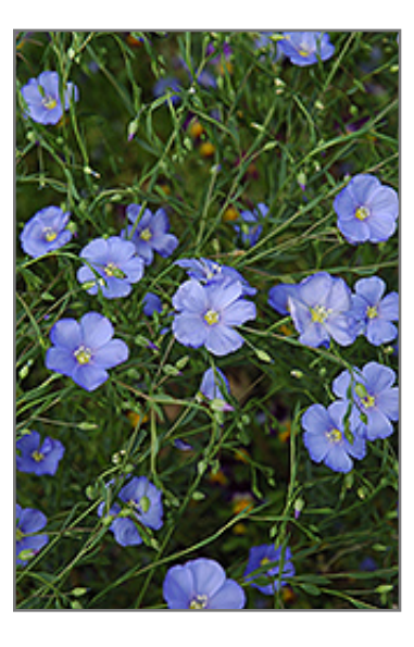
Perennial Flax flowers

Perennial Flax will grow to be about 24 inches tall at maturity, with a spread of 12 inches. When grown in masses or used as a bedding plant, individual plants should be spaced approximately 8 inches apart. It tends to be leggy, with a typical clearance of 1 foot from the ground, and should be underplanted with lower-growing perennials. It grows at a fast rate, and under ideal conditions can be expected to live for approximately 3 years. As an herbaceous perennial, this plant will usually die back to the crown each winter, and will regrow from the base each spring. Be careful not to disturb the crown in late winter when it may not be readily seen!