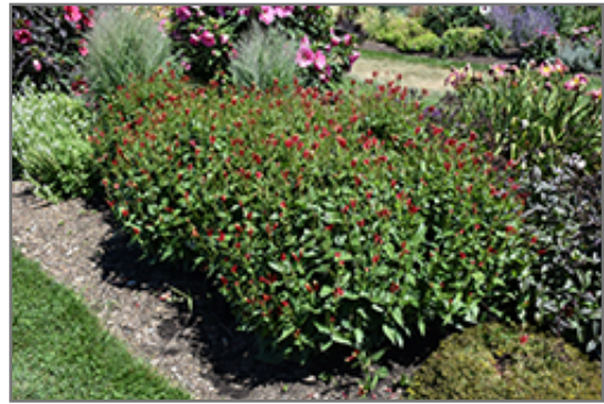
Little Redhead Indian Pink in bloom

Little Redhead Indian Pink will grow to be about 20 inches tall at maturity, with a spread of 24 inches. When grown in masses or used as a bedding plant, individual plants should be spaced approximately 20 inches apart. Its foliage tends to remain dense right to the ground, not requiring facer plants in front. It grows at a fast rate, and under ideal conditions can be expected to live for approximately 5 years. As an herbaceous perennial, this plant will usually die back to the crown each winter, and will regrow from the base each spring. Be careful not to disturb the crown in late winter when it may not be readily seen!