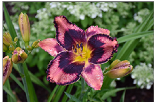
Rainbow Rhythm Storm Shelter Daylily flowers