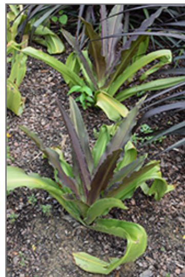
African Night Pineapple Lily

African Night Pineapple Lily is a fine choice for the garden, but it is also a good selection for planting in outdoor pots and containers. With its upright habit of growth, it is best suited for use as a 'thriller' in the 'spiller-thriller-filler' container combination; plant it near the center of the pot, surrounded by smaller plants and those that spill over the edges. It is even sizeable enough that it can be grown alone in a suitable container. Note that when growing plants in outdoor containers and baskets, they may require more frequent waterings than they would in the yard or garden.