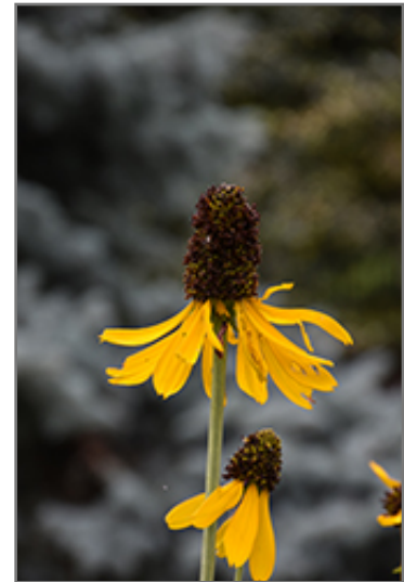
Giant Coneflower flowers

Our Growing Place Choice plants are chosen because they are strong performers year after year, staying attractive with less maintenance when planted in the right place.