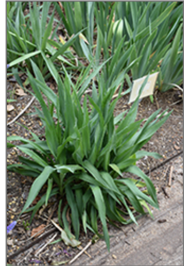
Rattlesnake Master

Rattlesnake Master is a fine choice for the garden, but it is also a good selection for planting in outdoor pots and containers. Because of its height, it is often used as a 'thriller' in the 'spiller-thriller-filler' container combination; plant it near the center of the pot, surrounded by smaller plants and those that spill over the edges. It is even sizeable enough that it can be grown alone in a suitable container. Note that when growing plants in outdoor containers and baskets, they may require more frequent waterings than they would in the yard or garden.