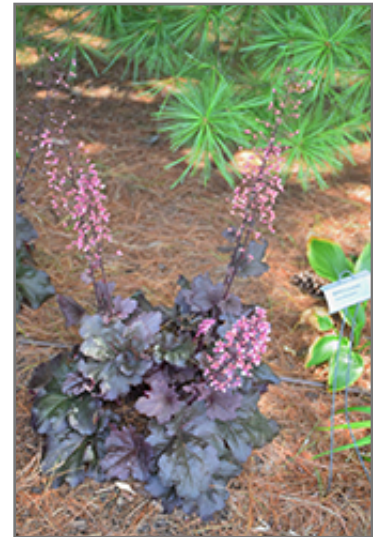
Primo Mahogany Monster Coral Bells in bloom

Primo Mahogany Monster Coral Bells is a fine choice for the garden, but it is also a good selection for planting in outdoor pots and containers. With its upright habit of growth, it is best suited for use as a 'thriller' in the 'spiller-thriller-filler' container combination; plant it near the center of the pot, surrounded by smaller plants and those that spill over the edges. Note that when growing plants in outdoor containers and baskets, they may require more frequent waterings than they would in the yard or garden.