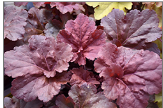
Primo Mahogany Monster Coral Bells foliage