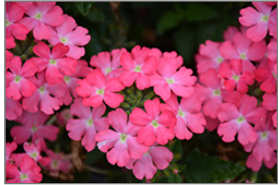
Firehouse Pink Verbena flowers

Firehouse Pink Verbena is recommended for the following landscape applications;