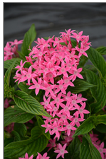
Lucky Star Pink Star Flower flowers

Lucky Star Pink Star Flower is recommended for the following landscape applications;