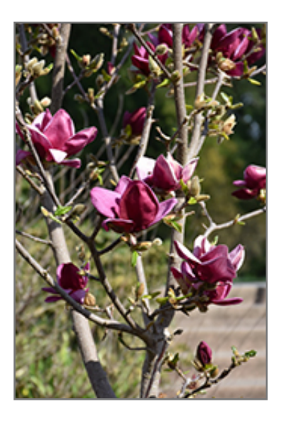
Genie Magnolia flowers