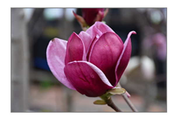
Genie Magnolia flowers