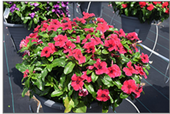
Tattoo Black Cherry Vinca in bloom

Tattoo Black Cherry Vinca will grow to be about 12 inches tall at maturity, with a spread of 8 inches. When grown in masses or used as a bedding plant, individual plants should be spaced approximately 6 inches apart. Its foliage tends to remain dense right to the ground, not requiring facer plants in front. Although it's not a true annual, this fast-growing plant can be expected to behave as an annual in our climate if left outdoors over the winter, usually needing replacement the following year. As such, gardeners should take into consideration that it will perform differently than it would in its native habitat.