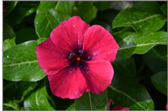
Tattoo Black Cherry Vinca flowers

This plant will require occasional maintenance and upkeep, and should not require much pruning, except when necessary, such as to remove dieback. It is a good choice for attracting butterflies to your yard, but is not particularly attractive to deer who tend to leave it alone in favor of tastier treats. It has no significant negative characteristics.