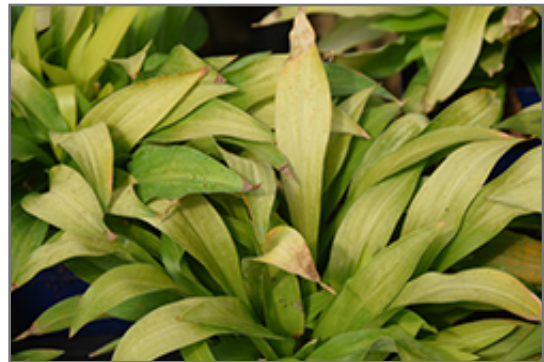
Munchkin Fire Hosta foliage