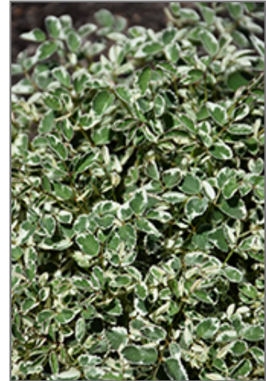
Little Angel Burnet flowers

Little Angel Burnet will grow to be only 4 inches tall at maturity extending to 10 inches tall with the flowers, with a spread of 14 inches. When grown in masses or used as a bedding plant, individual plants should be spaced approximately 12 inches apart. It grows at a medium rate, and under ideal conditions can be expected to live for approximately 15 years. As an herbaceous perennial, this plant will usually die back to the crown each winter, and will regrow from the base each spring. Be careful not to disturb the crown in late winter when it may not be readily seen!