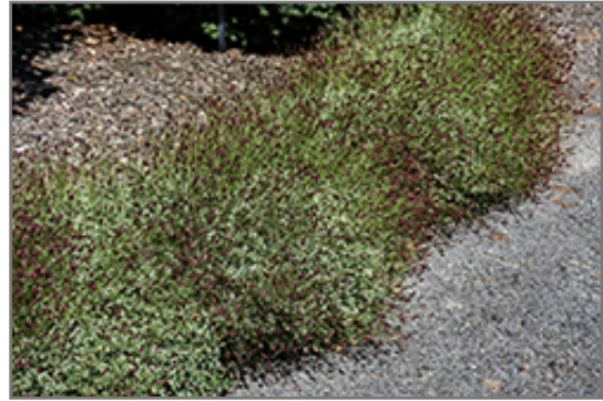
Little Angel Burnet in bloom